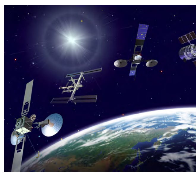
BSE: 532173 | NSE: CYBERTECH | ISIN: INE214A01019 | CIN: L72100MH1995PLC08478