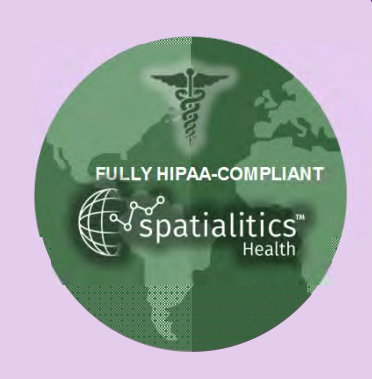
HIPAA-Compliant Spatialitics Health